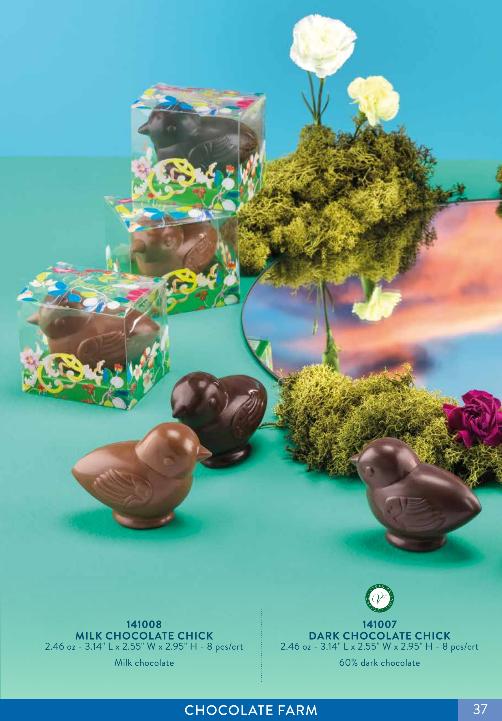
141008 MILK CHOCOLATE CHICK 2.46 oz - 3.14" L x 2.55" W x 2.95" H - 8 pcs/crt Milk chocolate