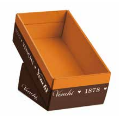
937967 EMPTY CARDBOARD DISPLAY FOR BULK 5,9" L x 9,84" W x 3,93" H