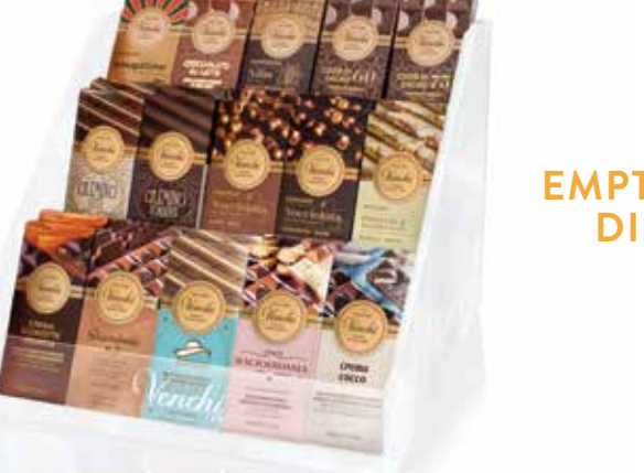
938504 EMPTY LARGE WOODEN DISPLAY FOR BARS cm 38x31,5x36 h