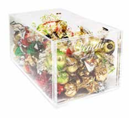
602741 EMPTY PLEXI BOX WITH FLAVOUR TAG 10,62" L x 5,7" W x 4,84" H