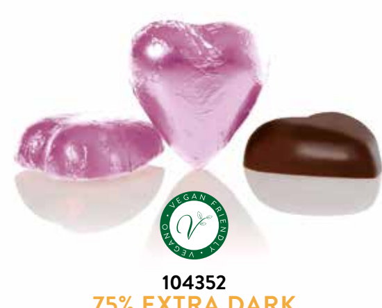
75% EXTRA DARK CHOCOLATE VALENTINES

Transparent blister for packaging with elastic bow