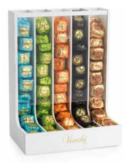
938507 EMPTY WOODEN DISPLAY FOR BULK 10,03" L x 6,69" W x 13,18" H