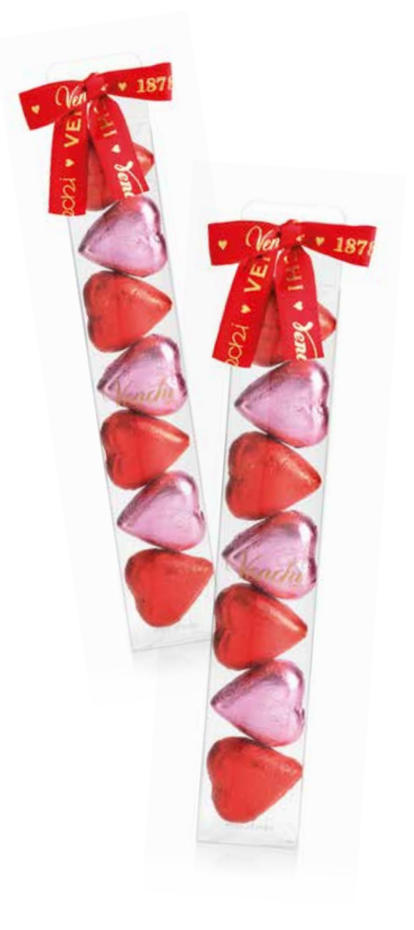
935826 EMPTY BLISTER